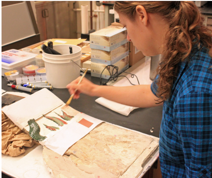
Above: Application of paints to the replica panel

Designed for Gertrude Vanderbilt Whitney from 1918 to 1923, the space was a social and spiritual refuge for the famous American art patroness, whose personal studio, Whitney Studio Club, and Whitney Museum of American Art were connected to and evolved within the building. Once a sumptuous interior, painted with elaborate polychromatic schemes and detailed with corresponding stained glass windows and decorative screens, the room has lost some of its original features over time due to transitions in ownership, changes in use, and several applications of over-painting.